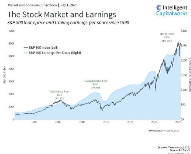
Chart: The stock market follows earnings in the long run

In the long run, growing corporate earnings are what drive financial markets higher, in spite of day-to-day headlines and investor fears. Current Wall Street estimates suggest that the S&P 500 earnings-per-share could reach $266 this year, representing a 12% growth rate. While much could change in the coming months, focusing on fundamental drivers such as earnings is far more important than reacting to daily headlines.